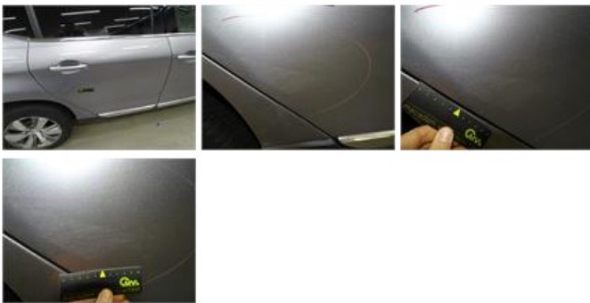
Rocker panel inner R R, Dent(s), LI - Repair and paint (complete) 115,56