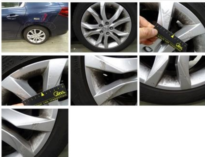
Wing R R, Scratch(es), Acceptable