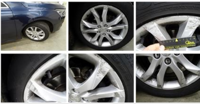
Alloy rim F L, Scratch(es), LI - Repair and paint (complete) 95,00