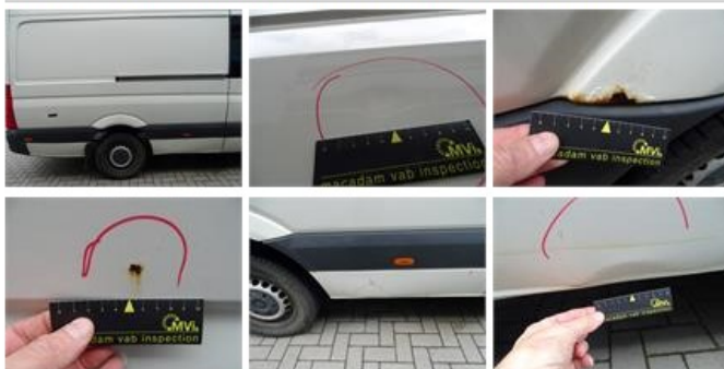
Bonnet, Stone chip(s), Acceptable