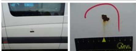
Trunk door R R, Dent(s) and scratch(es), It - Spot repair