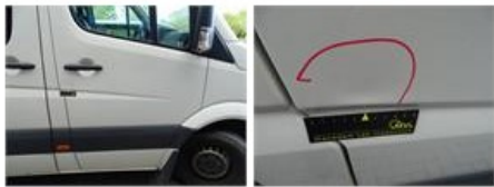
Trunk door R L, Dent(s) and scratch(es), It - Spot repair