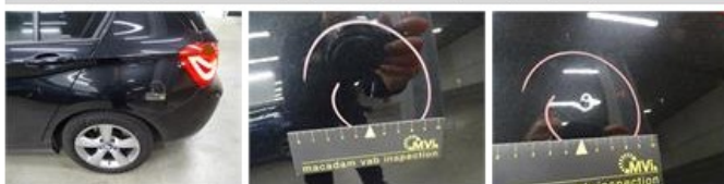
Alloy rim R R, Scratch(es), LI - Repair and paint (complete)