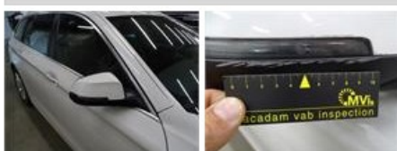
Wing R R, Dent(s) and scratch(es), LI - Repair and paint (complete)