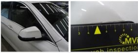
Door F R, Dent(s) and scratch(es), LI - Repair and paint (complete)