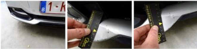
Bumper moulding F L, Broken, E - Replace