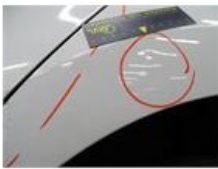
Door R L, Chemical polution, LI - Repair and paint (complete)