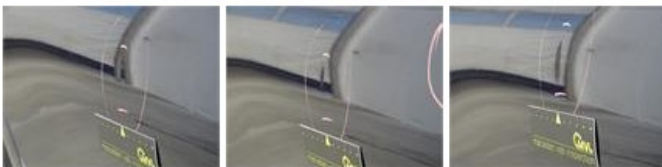
Alloy rim R L, Scratch(es), LI - Repair and paint (complete) 95,00