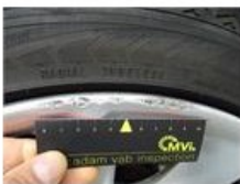
Alloy rim R R, Scratch(es), LI - Repair and paint (complete) 95,00