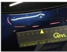
Bumper F, Scratch(es), LI - Repair and paint (complete) 0,00