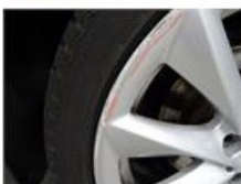
Alloy rim F R, Scratch(es), LI - Repair and paint (complete) 95,00