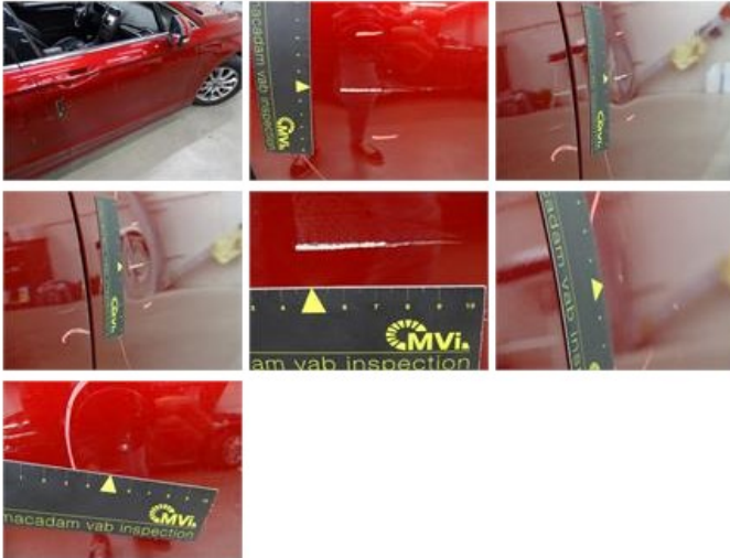
Door R L, Scratch(es), Acceptable 0,00