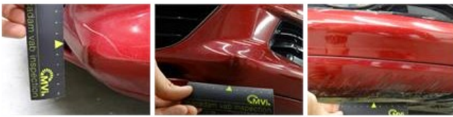
Door R R, Scratch(es), LI - Repair and paint (complete)