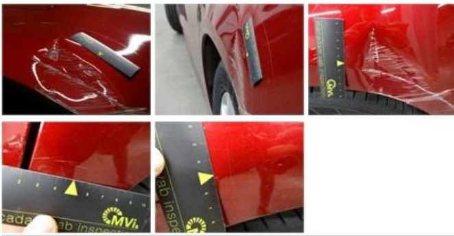
Door F R, Dent(s) and scratch(es), LI - Repair and paint (complete) 318,35