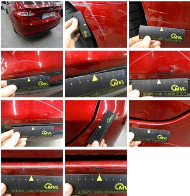
Bumper F, Dent(s) and scratch(es), LI - Repair and paint (complete) 211,80