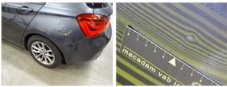
Bumper R, Scratch(es), LI - Repair and paint (complete) 211,80