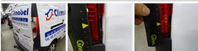
Reflector, Broken, E - Replace