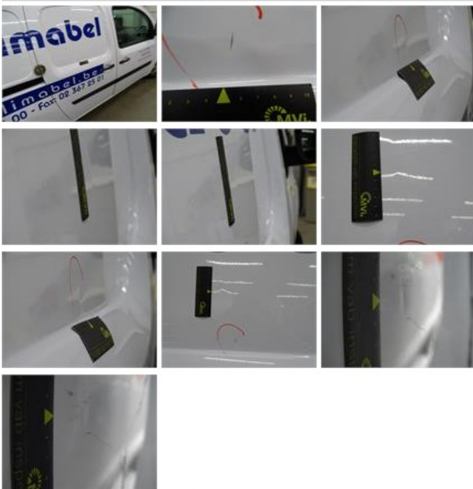
Door F L, Scratch(es), Acceptable