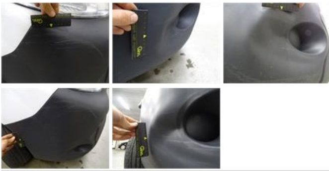
Sidewall panel RR, Broken, E - Replace