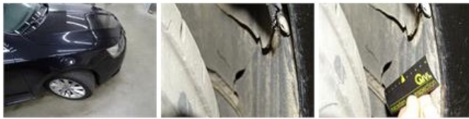
Bumper R, Dent(s) and scratch(es), LI - Repair and paint (complete)