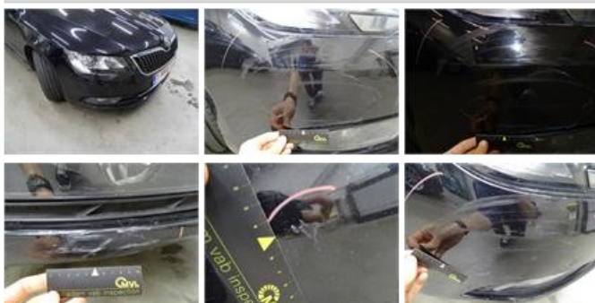
Wing R R, Dent(s) and scratch(es), Le - Replace and paint