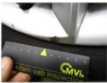
Door R R, Dent(s) and scratch(es), Le - Replace and paint