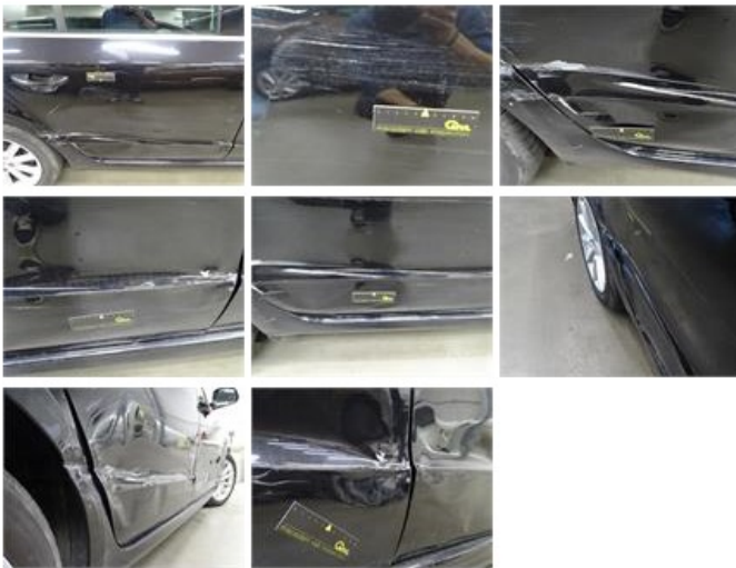
Door F R, Dent(s) and scratch(es), Le - Replace and paint