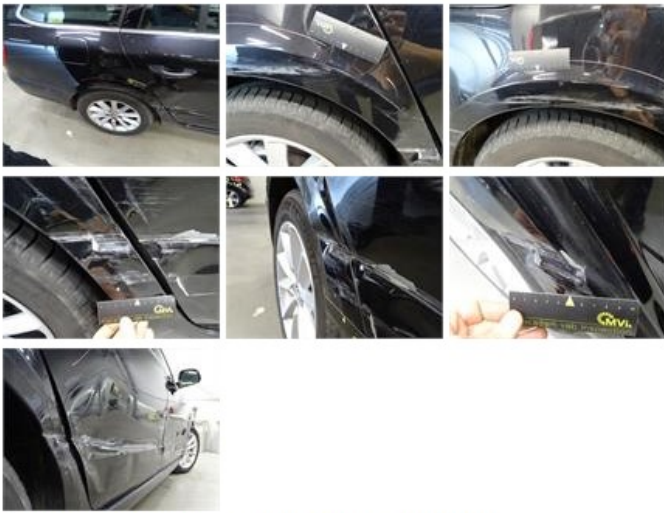
Alloy rim F L, Scratch(es), LI - Repair and paint (complete)