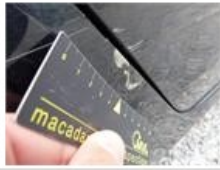
Door R R, Scratch(es), LI - Repair and paint (complete)