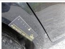
Wing R L, Repaired, No repair