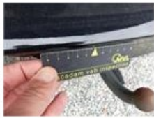
Door F L, Dent(s) and scratch(es), Acceptable