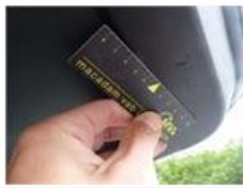
Wing R R, Scratch(es), Repair/replace (lump sum)