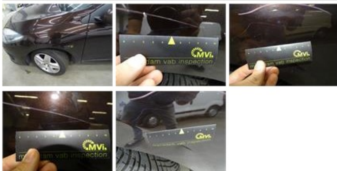
Wing R L, Scratch(es), LI - Repair and paint (complete)