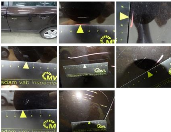
Wing F L, Scratch(es), LI - Repair and paint (complete)