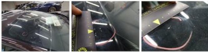
Ceiling, Stain, Cleaning