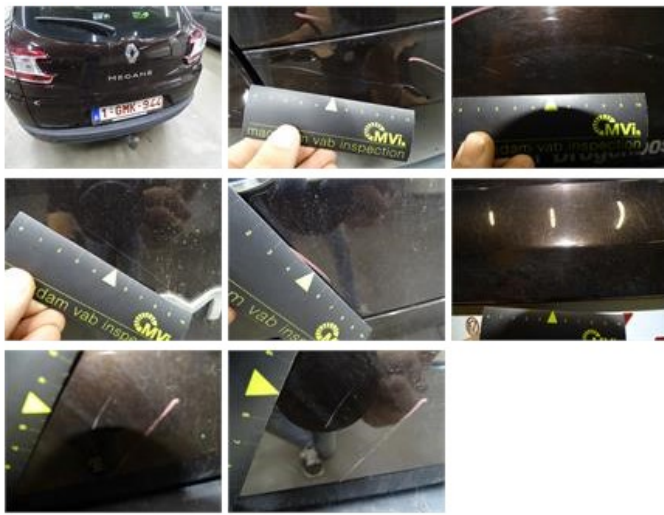
Windscreen, Stone chip(s), Acceptable