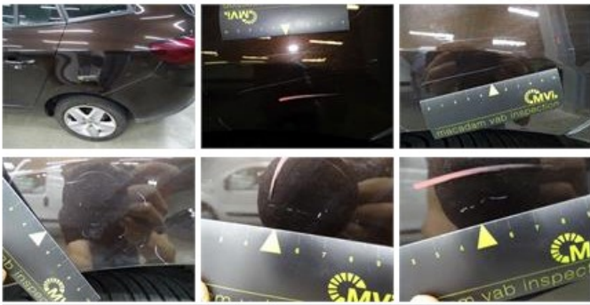
Door R R, Dent(s) and scratch(es), LI - Repair and paint (complete)