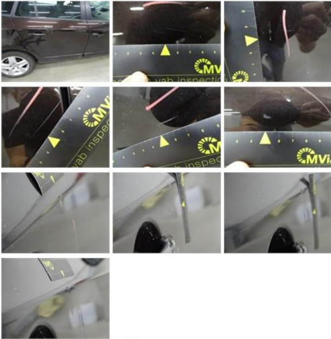
Wing R R, Scratch(es), Acceptable