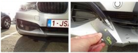
Bumper F, Dent(s) and scratch(es), It - Spot repair