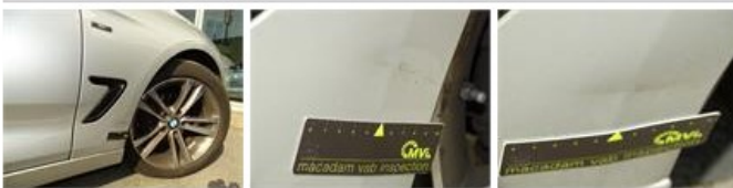
Alloy rim F R polished, Scratch(es), LI - Repair and paint (complete)