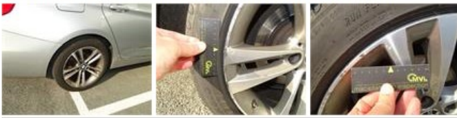
Alloy rim F L polished, Scratch(es), LI - Repair and paint (complete)