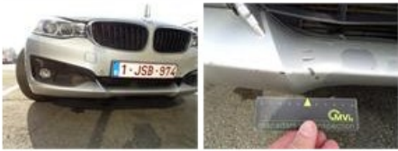
Bumper moulding R, Scratch(es), Tu - Touch up