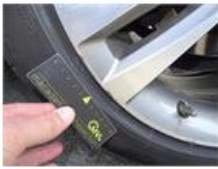
Alloy rim R R polished, Scratch(es), LI - Repair and paint (complete)