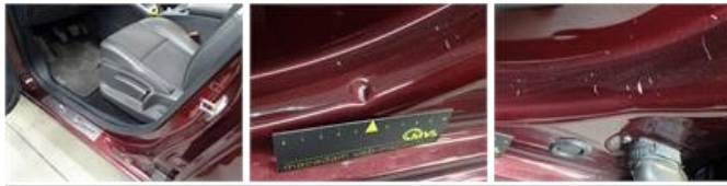
Bumper corner R R, Scratch(es), Acceptable