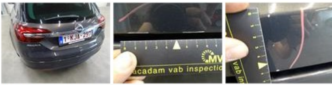
Bonnet, Scratch(es), Acceptable