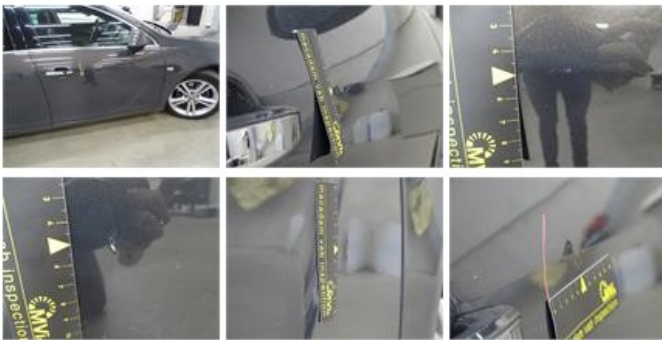
Roof pillar L, Dent(s), PDR - Paintless dent repair