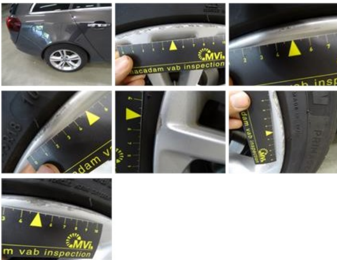
Alloy rim F R, Scratch(es), LI - Repair and paint (complete)