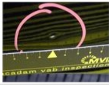
Door F L, Dent(s) and scratch(es), LI - Repair and paint (complete)