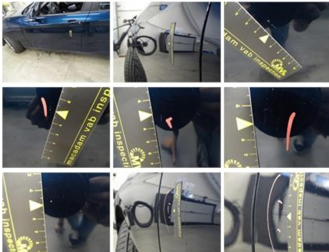
Wing R R, Scratch(es), Acceptable