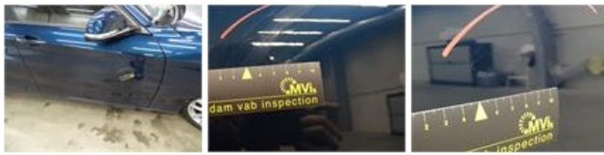
Windscreen, Stone chip(s), Acceptable