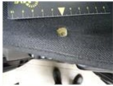
Trunk door panel L, Hole, E - Replace