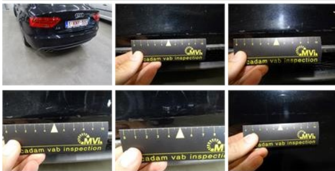
Wing F R, Scratch(es), LI - Repair and paint (complete)