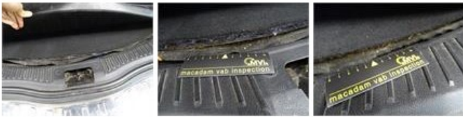
Bumper R, Scratch(es), LI - Repair and paint (complete) 211,80