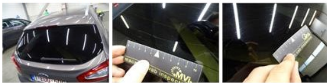
Windscreen, Stone chip(s), Acceptable