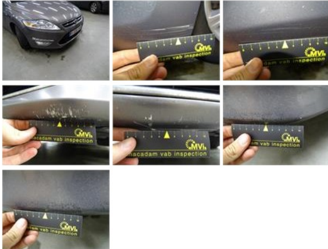
Door F R, Scratch(es), Acceptable