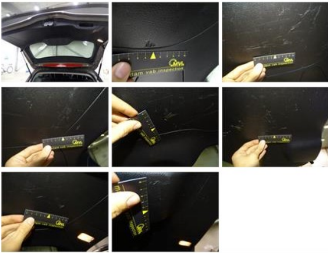
Boot carpet, Tear, E - Replace 100,00