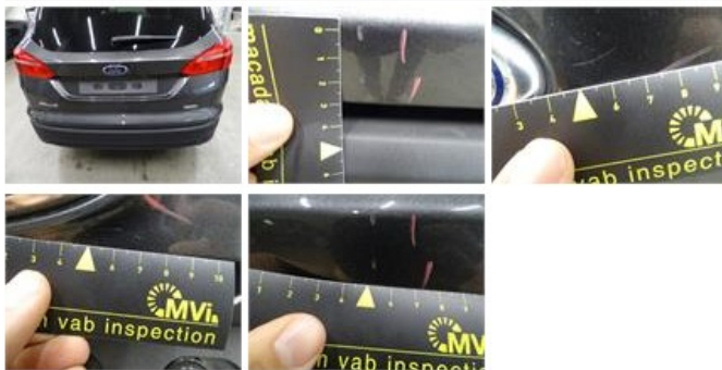
Door R L, Scratch(es), Acceptable