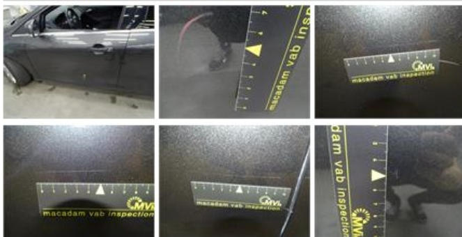
Wing F L, Scratch(es), Acceptable