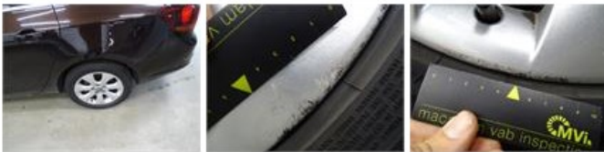
Door F R, Scratch(es), Acceptable