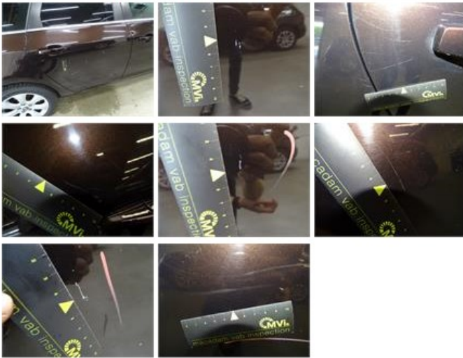
Door R L, Scratch(es), LI - Repair and paint (complete)