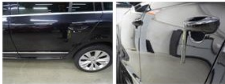
Bonnet, Scratch(es), LI - Repair and paint (complete)