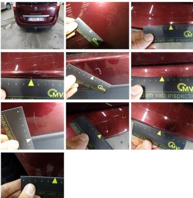
Wing F R, Scratch(es), Acceptable