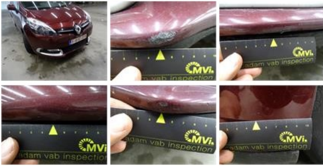
Wing R L, Dent(s) and scratch(es), LI - Repair and paint (complete)