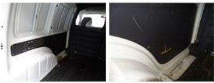
Bodywork, Glue residues, Acceptable