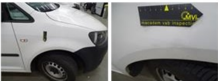
Bumper R, Scratch(es), Smart repair