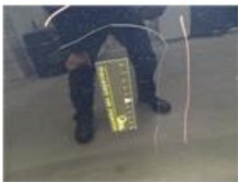
Wing R L, Dent(s) and scratch(es), LI - Repair and paint (complete)