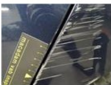
Foglight L, Broken, E - Replace