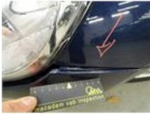
Door R R, Dent(s) and scratch(es), LI - Repair and paint (complete)