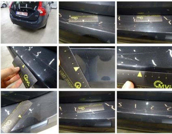
Door R R, Dent(s) and scratch(es), LI - Repair and paint (complete)