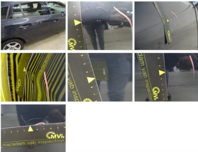
Mirror side blinker R, Broken, E - Replace