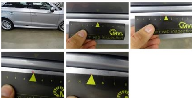
Bumper F, Scratch(es), LI - Repair and paint (complete)