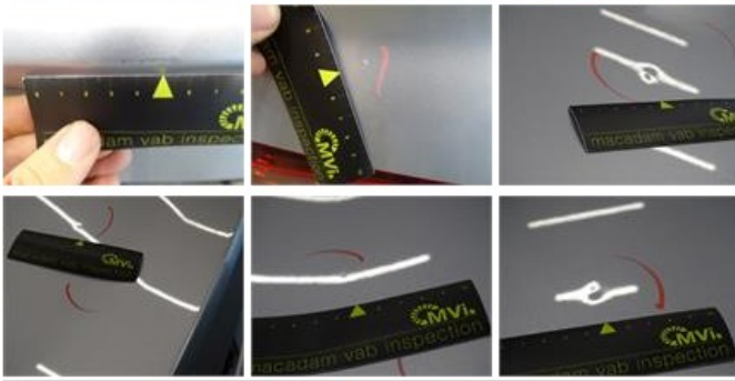
Alloy rim R R, Scratch(es), LI - Repair and paint (complete)