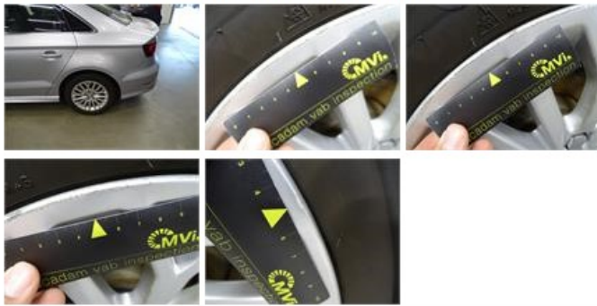
Sill outer R, Bad repair, Acceptable