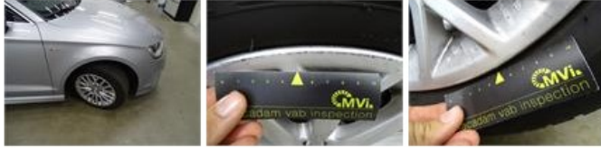
Wing R L, Scratch(es), Acceptable