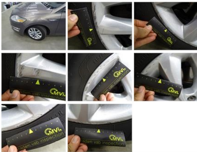
Alloy rim R L, Scratch(es), Acceptable