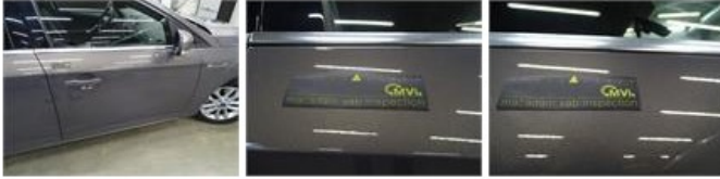
Door R L, Scratch(es), Acceptable