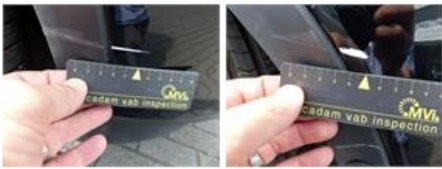
Door R L, Scratch(es), Acceptable