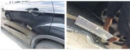
Tailgate, Scratch(es), It - Spot repair