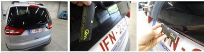
Reflector, Broken, E - Replace