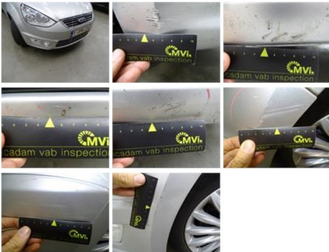
Door R R, Bad repair, Acceptable