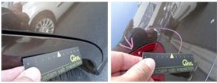
Rearlight R , Scratch(es), E - Replace