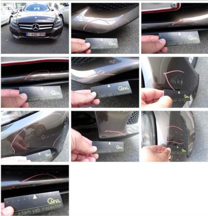
Wing R R, Dent(s) and scratch(es), LI - Repair and paint (complete) 308,20