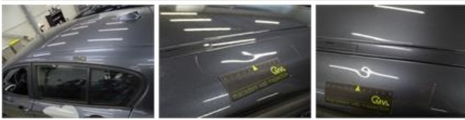
Wing R L, Dent(s), PDR - Paintless dent repair