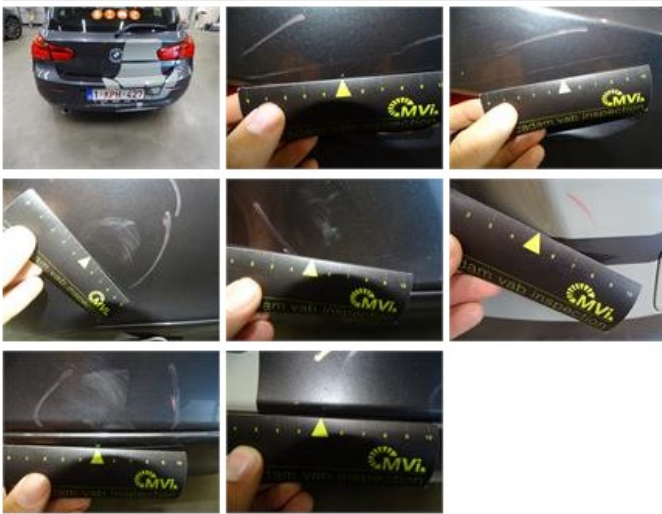
Rearview mirror housing R, Scratch(es), LI - Repair and paint (complete)