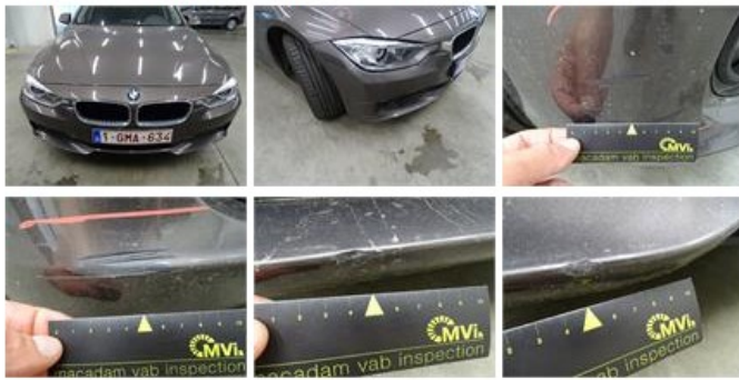
Wing F R, Chemical polution, LI - Repair and paint (complete)