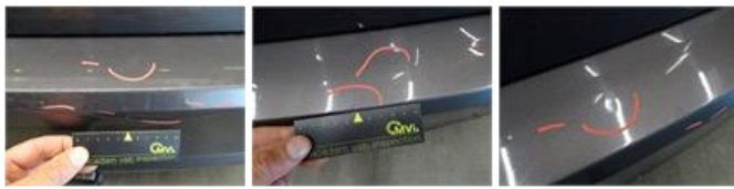
Bumper F, Dent(s) and scratch(es), LI - Repair and paint (complete)