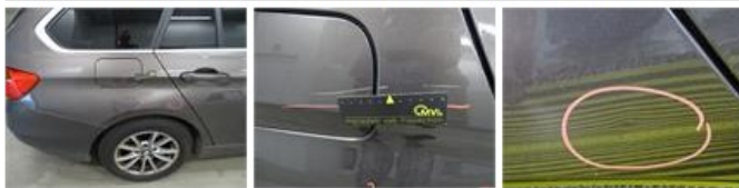
Wing R L, Dent(s), PDR - Paintless dent repair