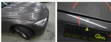
Wing R R, Dent(s) and scratch(es), LI - Repair and paint (complete)