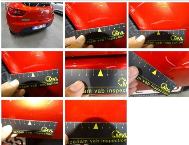
Door R L, Scratch(es), LI - Repair and paint (complete)