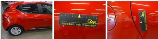
Rear window, Scratch(es), Acceptable