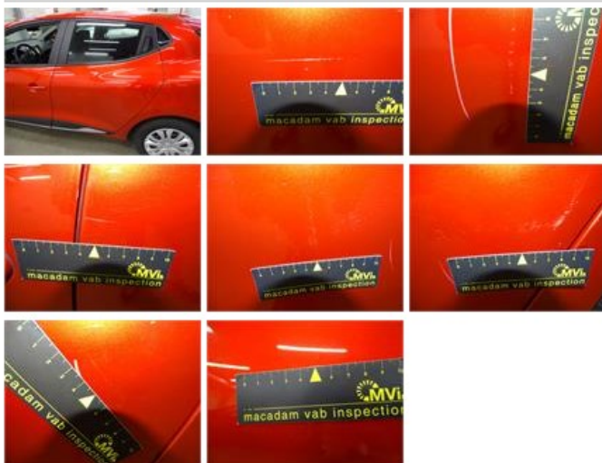
Wing F L, Scratch(es), Acceptable