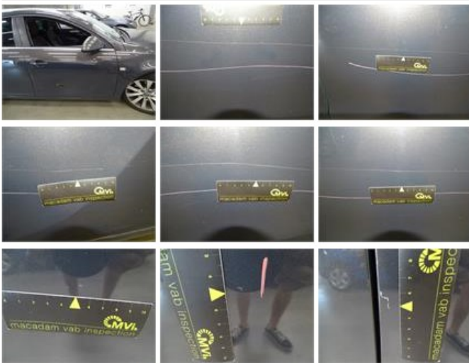
Wing R L, Scratch(es), LI - Repair and paint (complete)