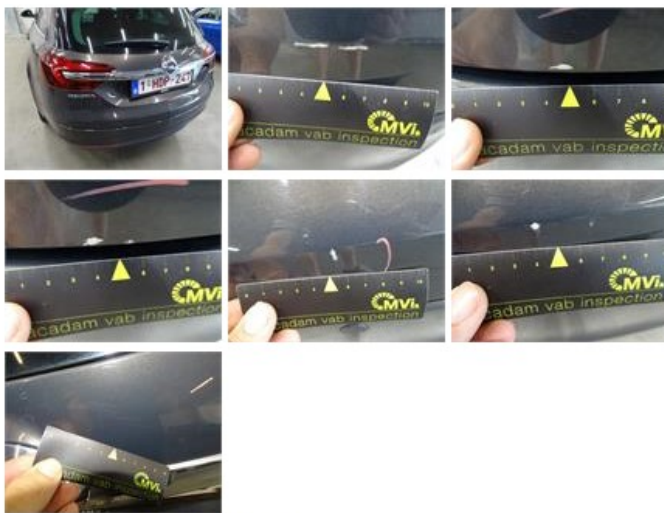
Rear window, Scratch(es), Acceptable