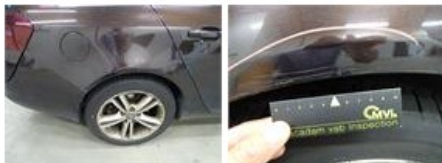
Alloy rim F R, Scratch(es), LI - Repair and paint (complete)