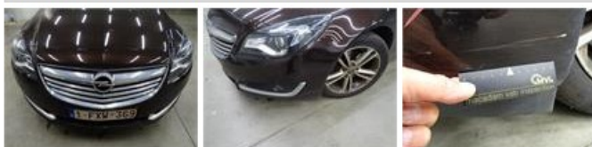
Bonnet, Chemical pollution, LI - Repair and paint (complete)