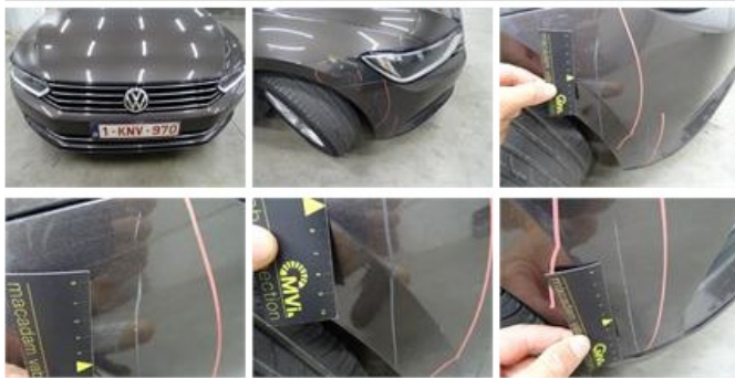
Bonnet, Stone chip(s), Acceptable