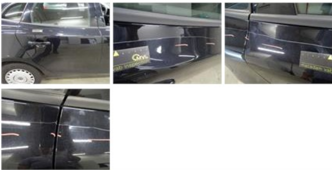
Bumper R, Scratch(es), LI - Repair and paint (complete) 211,80