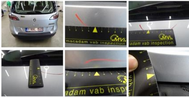
Bumper F, Scratch(es), Acceptable