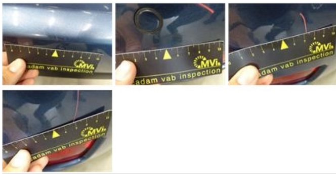
Bonnet, Chemical pollution, 67 - Polish