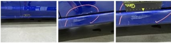
Door F R, Scratch(es), LI - Repair and paint (complete)