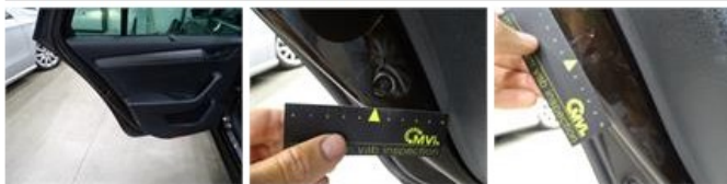
Door F R, Bad repair, Acceptable