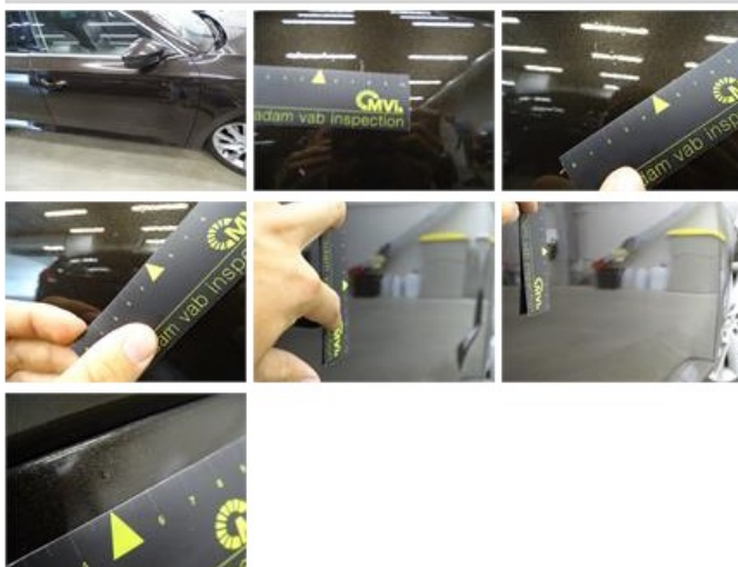
Bumper F, Scratch(es), Acceptable