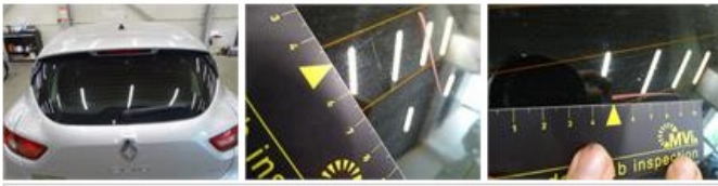
Wing R L, Scratch(es), Acceptable