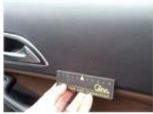
Door R L, Repaired, 67 - Polish