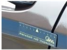
Door panel F R, Tear, E - Replace