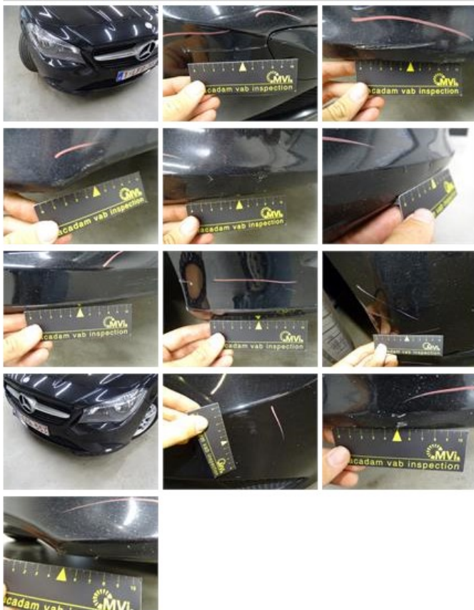
Wing R R, Dent(s) and scratch(es), LI - Repair and paint (complete)