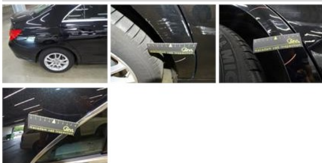
Alloy rim R L, Scratch(es), LI - Repair and paint (complete)