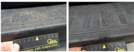
Trunk door R L, Dent(s), PDR - Paintless dent repair