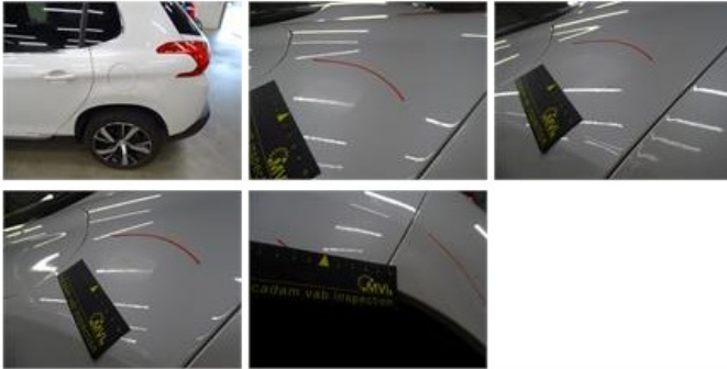
Door panel R L, Scratch(es), Acceptable