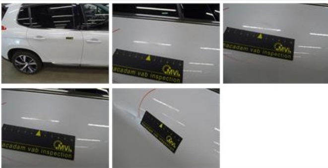
Wing F L, Scratch(es), LI - Repair and paint (complete)